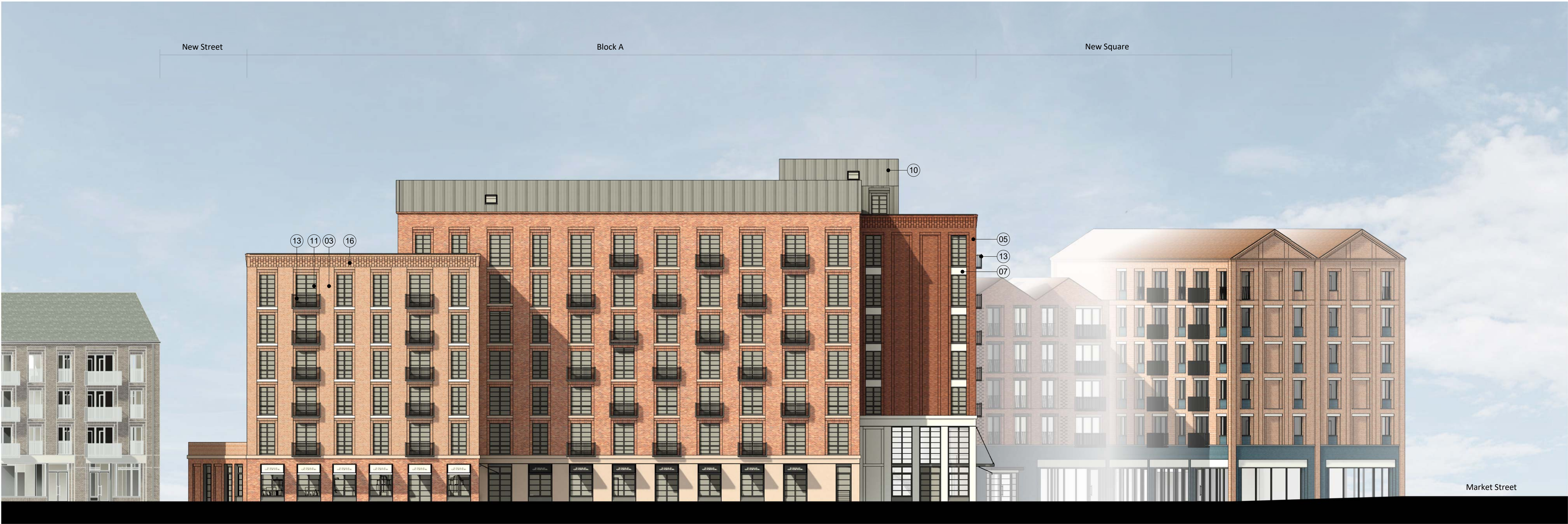
2 Block A - West (New Street) Elevation 1 : 200