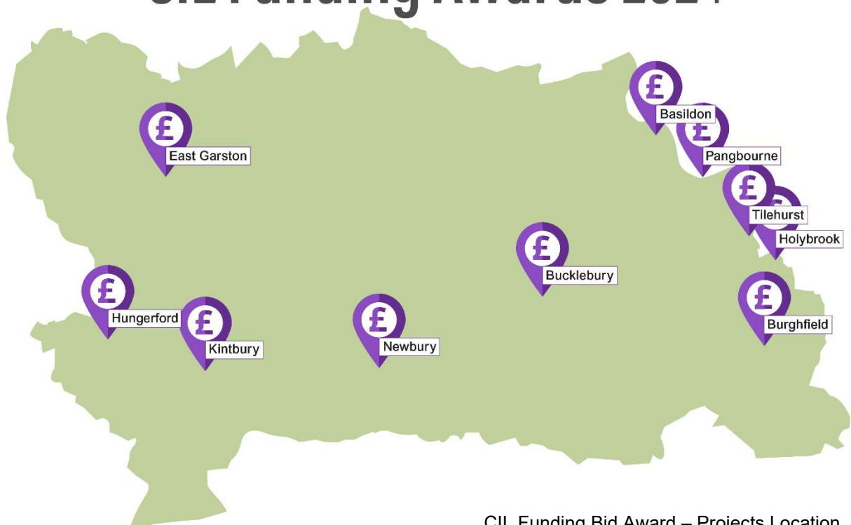
CIL Funding Bid Award – Projects Location