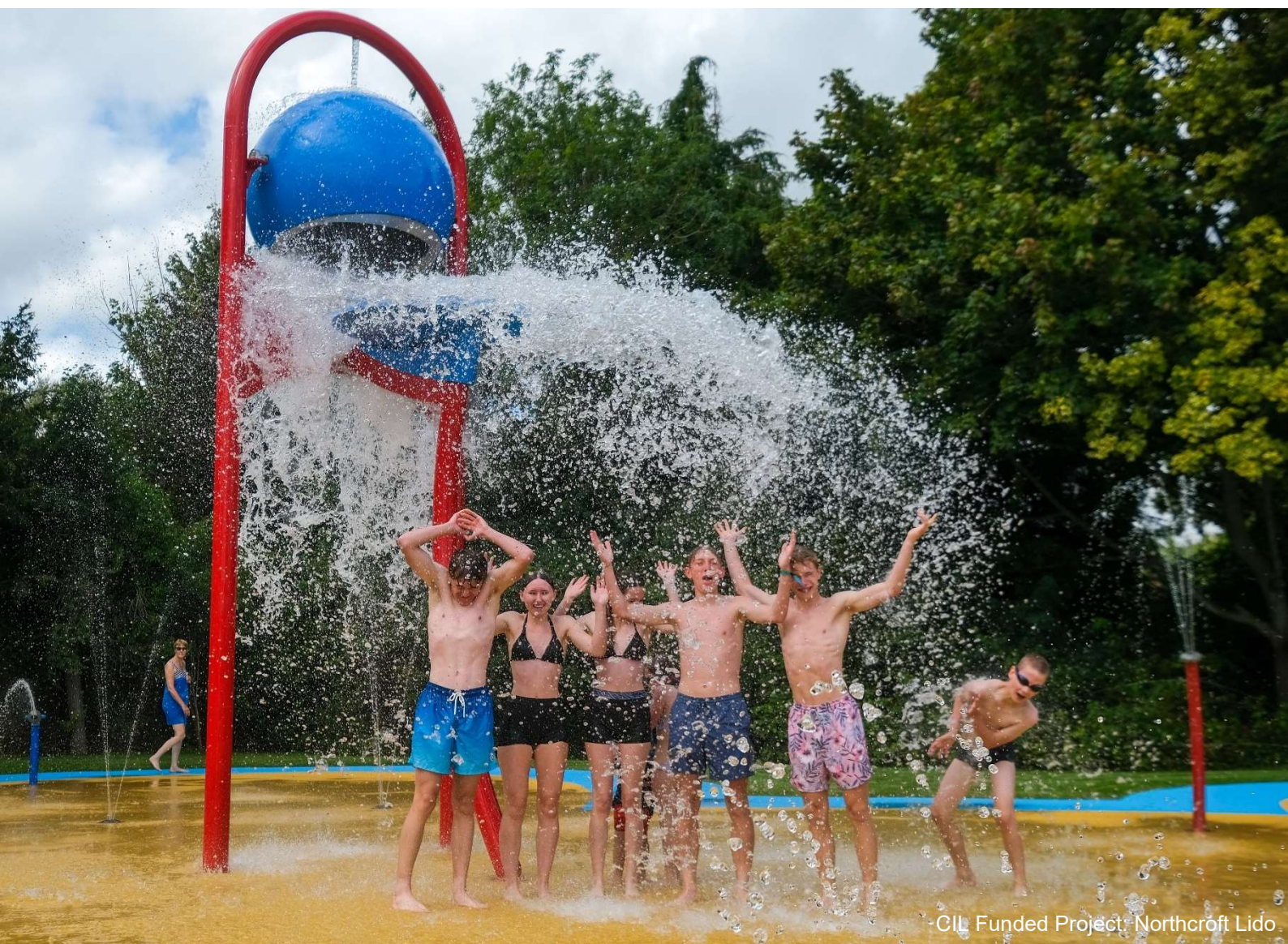
CIL Funded Project Northcroft Lido