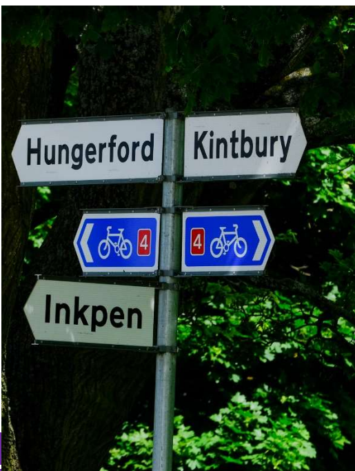
CIL Funded Projects (Left to Right): Road Signage, EV Charge Points, Cycle Path Improvements