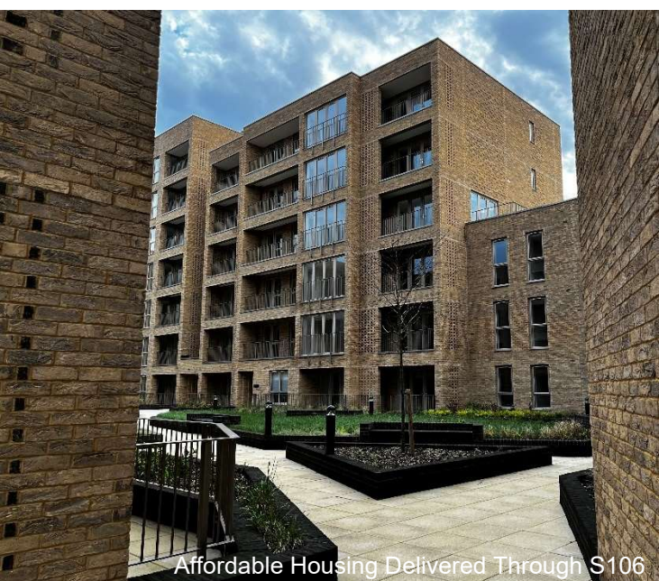
Affordable Housing Delivered Through S106