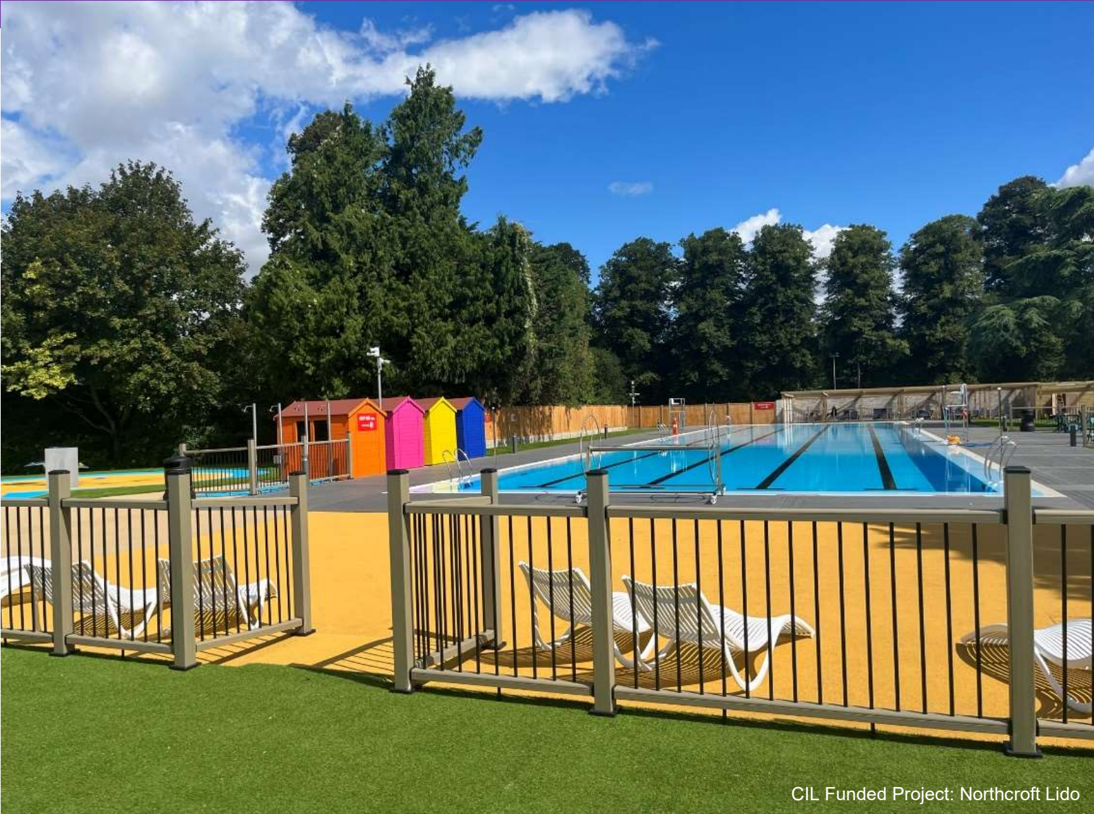
CIL Funded Project: Northcroft Lido