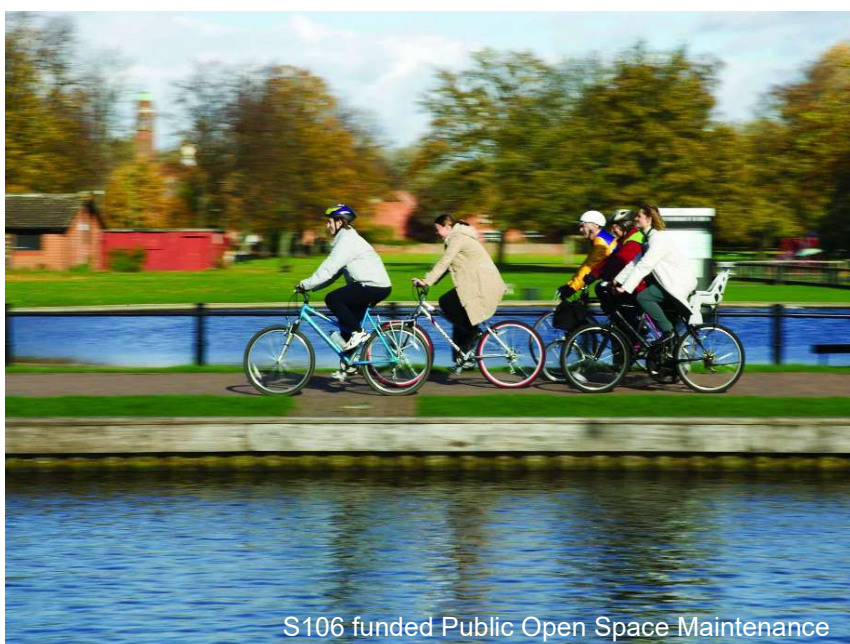
S106 funded Public Open Space Maintenance